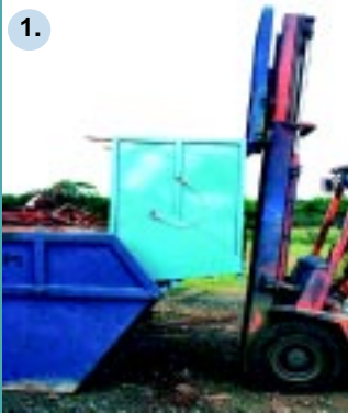
1. Driver positions SUPER-BURRO so that push arm on base touches edge of skip. As fork truck is driven forwards, mechanism unlocks, releasing hinged base.