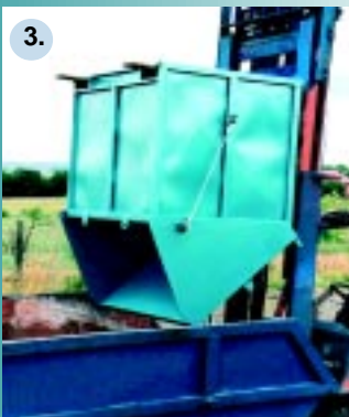
3. Driver can safely lift the SUPER-BURRO to allow full emptying.