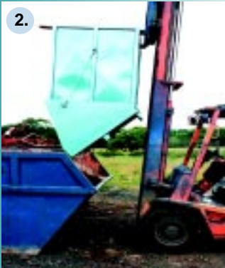
2. Driver then lifts the forks, allowing SUPER-BURRO base to open further. Contents are discharged in a controlled manner.